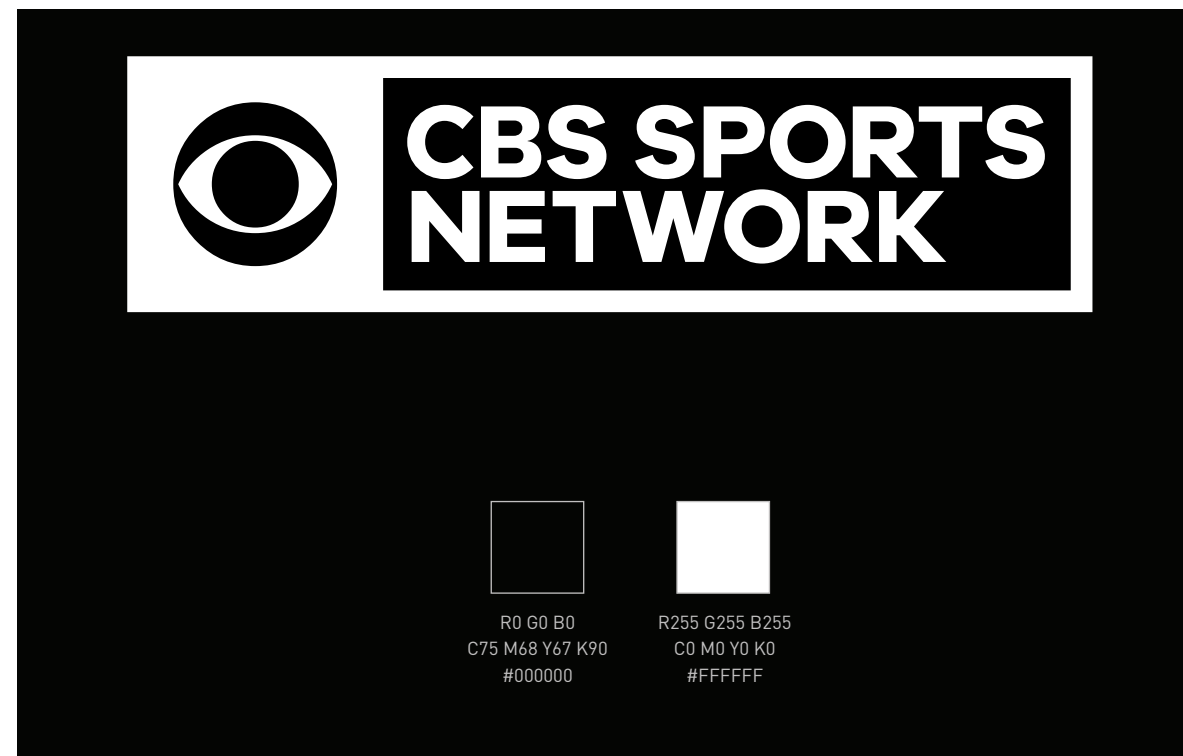
1-COLOR OVER LIGHT