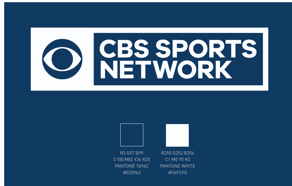
COLOR OVER LIGHT

R250 G252 B254 C1 M0 Y0 K0 PANTONE WHITE #FAFCFE